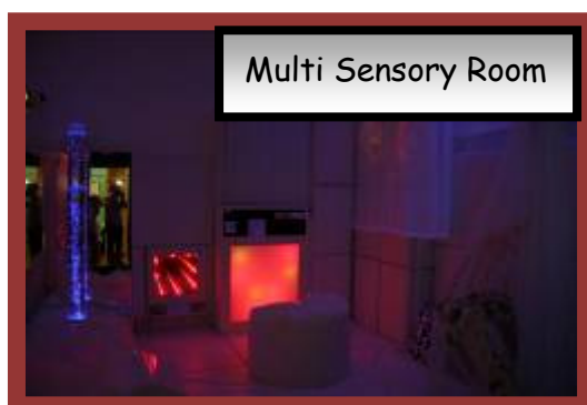
Multi Sensory Room

The refurbished Multi Sensory Room is now fully functional and in constant use for 1:1 and small group sessions. The track hoist means it is completely accessible to all students. The design has incorporated more cause and effect equipment like the interactive fibre optic carpet which changes colour when the hand buttons are activated.