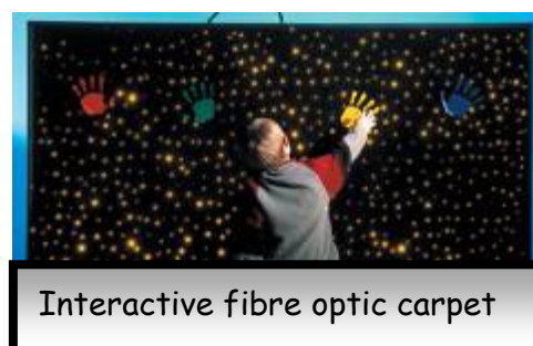
Interactive fibre optic carpet

Over the summer, the OT and PT offices were relocated to make a joint therapy assessment room. The old OT room has now become a Sensory Motor Room. Students are timetabled individually and in small groups throughout the day. It has been great to watch the students getting the sensory input they need in a safe environment.