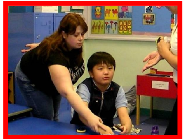
Darius requesting reinforcers (Phase I)