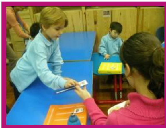
Leo wants a biscuit!