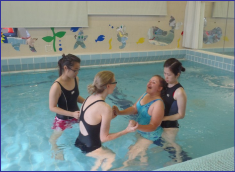
A student doing hydrotherapy with the Physiotherapist

The Jockey Club Sarah Roe School (JCSRS) values the individuality of each student. We aim to provide a specialised and differentiated education within a nurturing and supportive environment.