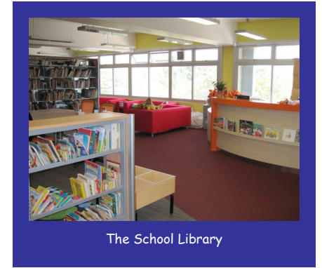
The School Library

The school curriculum for both primary and secondary students aims to develop independence and life skills for each student.