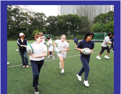
Secondary students learning rugby skills

In addition to the classroom curriculum, students have the opportunity to participate in a variety of other activities. The school has specialised PE and music teachers. Each class has a monthly educational visit.