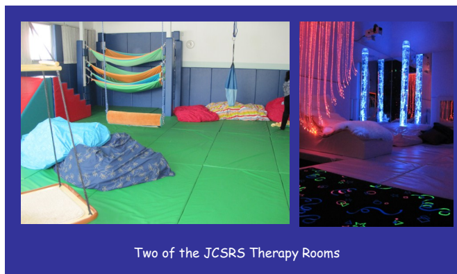
Two of the JCSRS Therapy Rooms