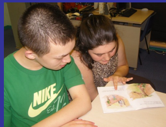
Students reading together

The school is situated in a pleasant area of Kowloon and shares a campus with a secondary school. It is also adjacent to an ESF primary school, which provides opportunities for integration. The catchment area for the school is the whole of Hong Kong. The school PTA operates a bus service which covers much of Hong Kong.